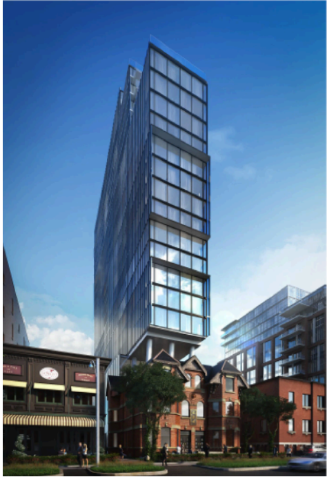
Developer's rendering of 23-story proposed building (Note how top of building is obscured to mask true height)

THERE'S A LAMB WHO WANTS TO SLAUGHTER WHAT HAS MADE OUR COMMUNITY LIVEABLE Brad Lamb is smashing ahead with plans to build this monstrosity with no community input and contrary to planning principles of the City and our local Councillor.