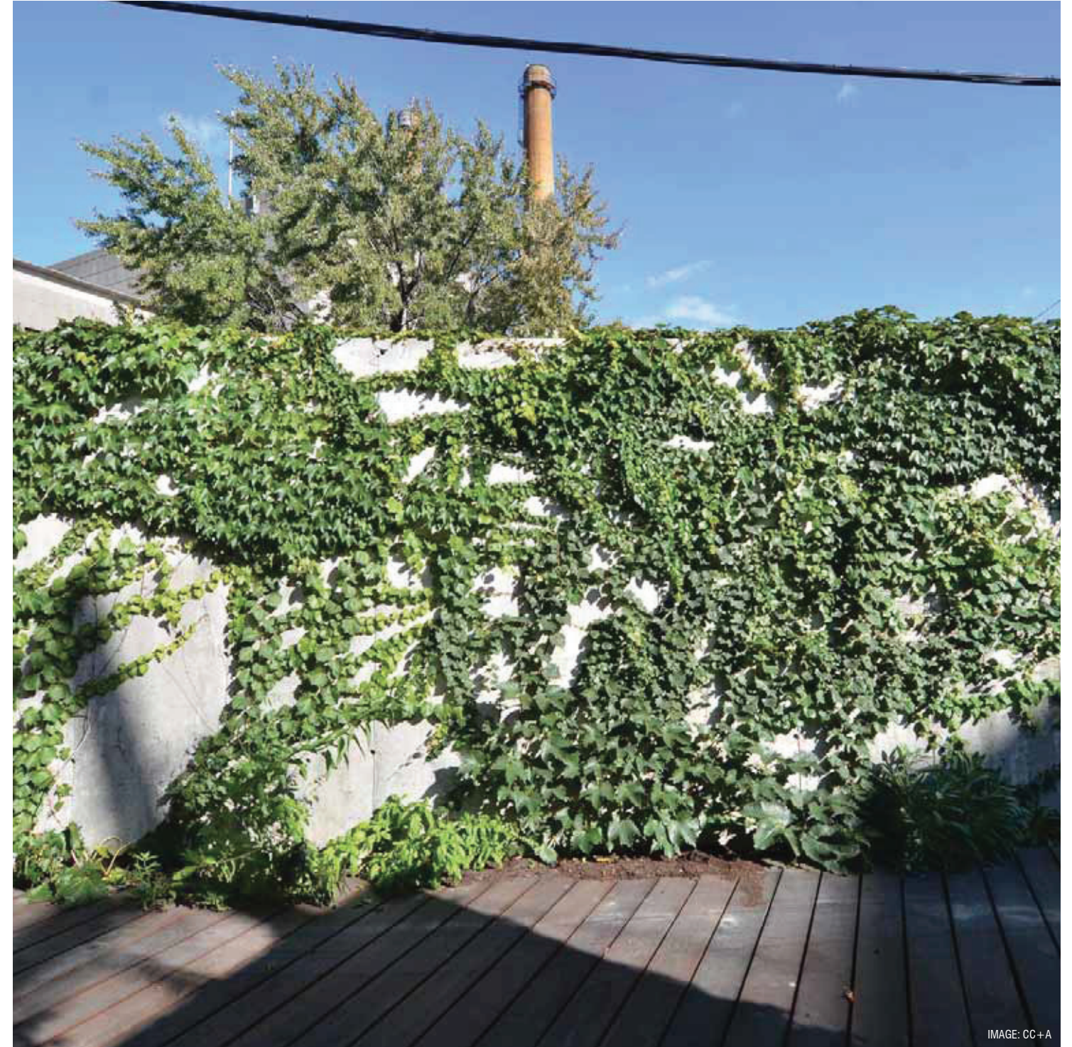
VINES ON C.I.P. CONCRETE WALL - CHATEAU NOIR, MONTRÉAL