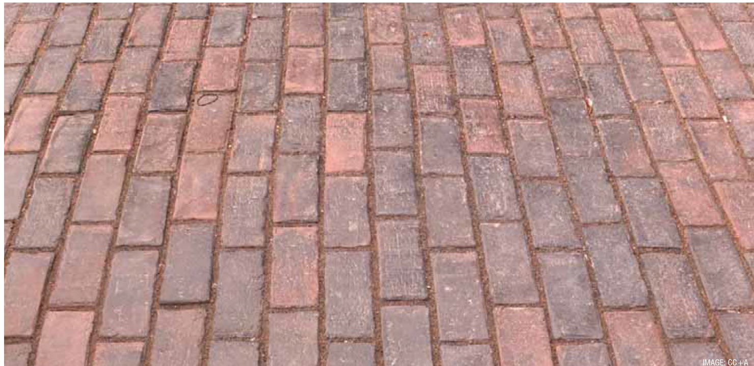
MOCK BRICK CONCRETE UNIT PAVING (UNILOCK TOWNHALL) - CHERRY STREET, DISTILLERY DISTRICT, TORONTO