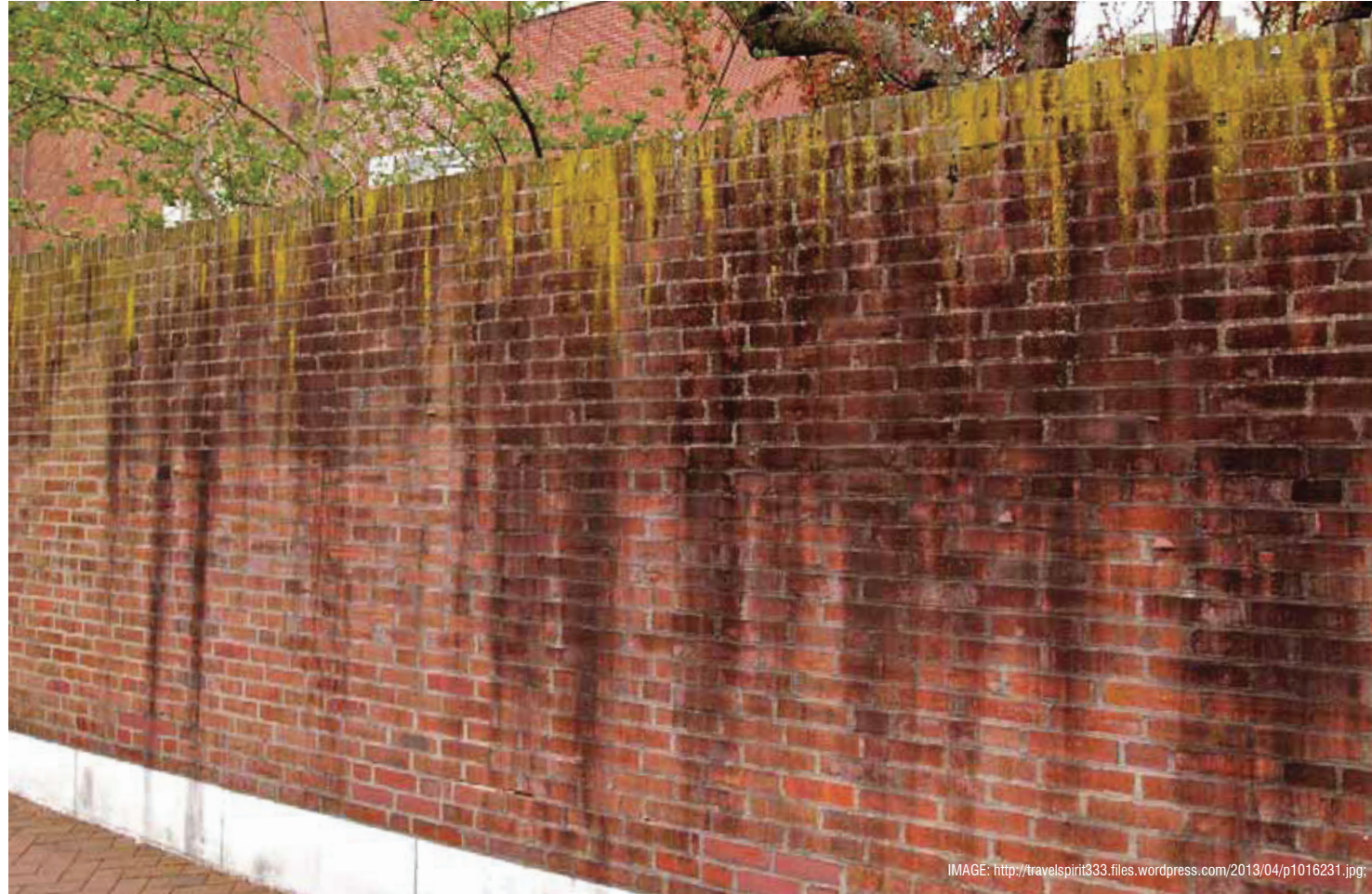
2m BRICK WALL - PHILADELPHIA

IMAGE: http://travelspirit333.files.wordpress.com/2013/04/p1016231.jpg