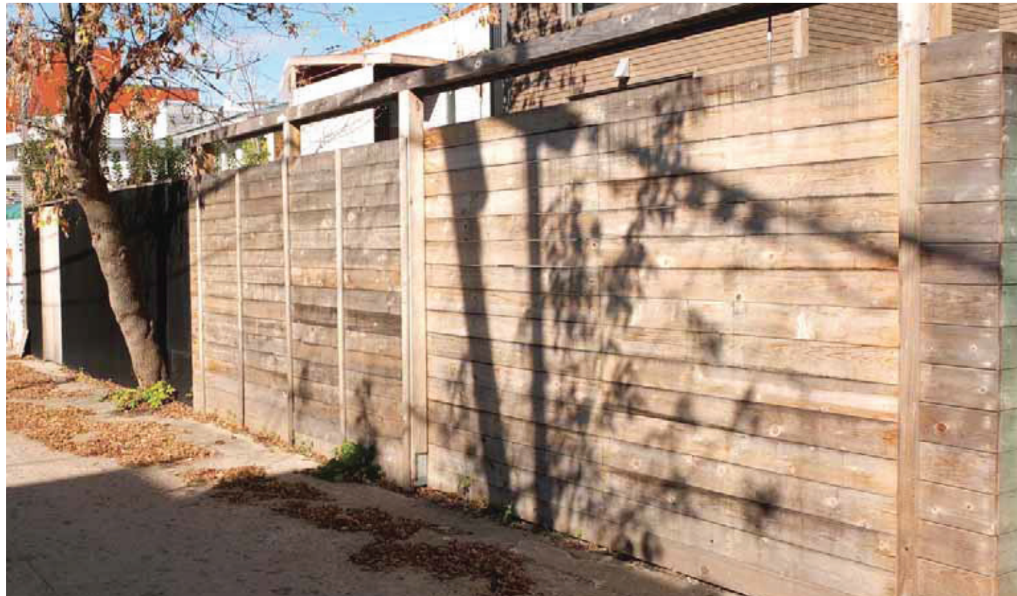
TYPICAL RAIL MOUNTED SLIDING DOOR - ALLEY, MONTRÉAL

IMAGE: http://travelspirit333.files.wordpress.com/2013/04/p1016231.jpg