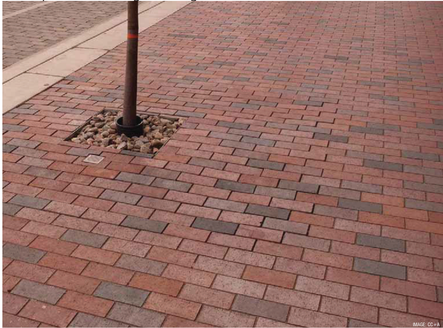
CLAY PAVERS (ENDICOTT) - CHERRY STREET, DISTILLERY DISTRICT, TORONTO