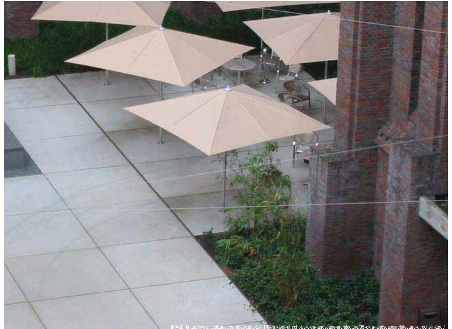
CONCRETE TILES - UTRECHT, NETHERLANDS

IMAGE: http://www.landazine.com/index.php/2011/04/inkpot-utrecht-by-okra-landscape-architecture/05-okra-landscapearchitecture-utrecht-inkpot/