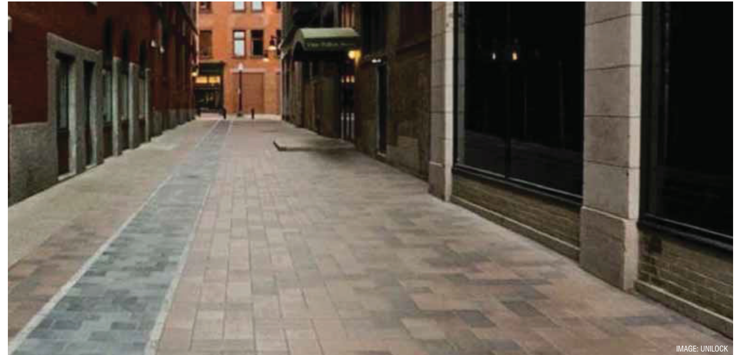
CONCRETE PAVERS (UNILOCK BELPASSO) - FULTON & CASS DOWN CITY, PROVIDENCE, RHODE ISLAND